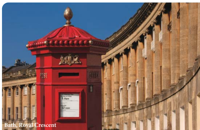
Bath, Royal Crescent

This holiday is operated by Travel Editions Group Travel